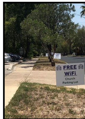
Free WiFi in the Woodlawn parking lot.

"Do all the good you can, by all the means you can, in all the ways you can, in all the places you can, at all the times you can, to all the people you can, as long as ever you can." -John Wesley