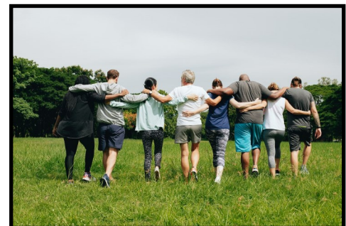
"They could only go forward, and they did"