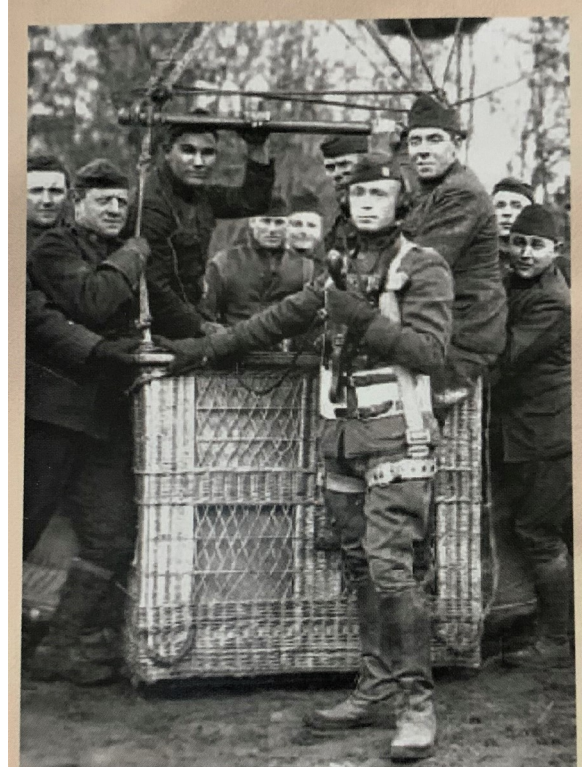
43rd Balloon Company at Camp John Wise

On Wednesdays, the young people of the church provided entertainment at the camp, Thursdays were designated for sewing and mending, and Friday nights the church was thrown open to the soldiers, who came in large numbers.