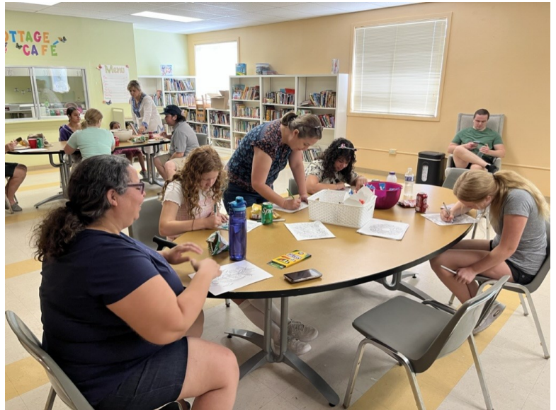
Some folks enjoyed taking a break from the fast pace of pickleball, and relaxed while coloring and eating.