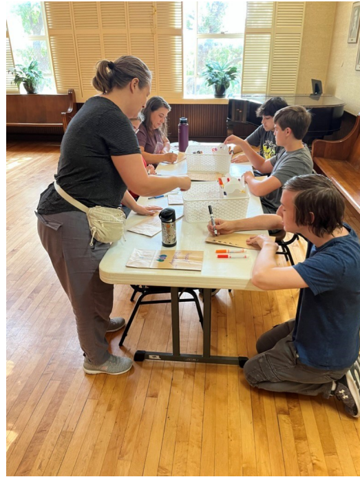
Preparation of the gift bags thanks to the generosity of LHUMC.