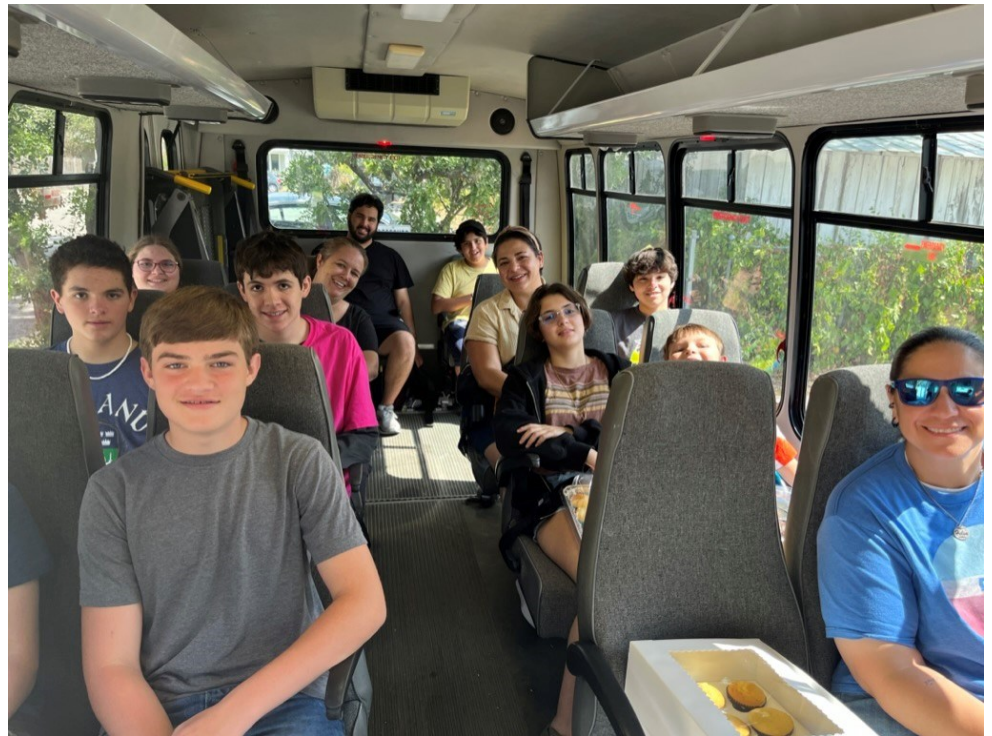
A bus full of willing hearts and hands for service!