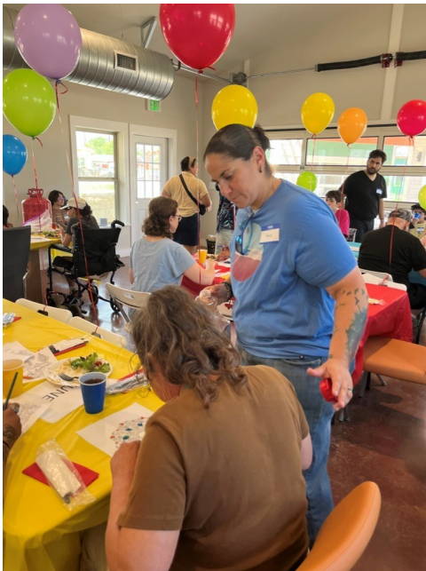
The Everybody's Birthday Party was a great success with 22 from LHUMC serving the Towne Twin Village community. Many thanks to everyone who helped to make these newly housed seniors feel loved.