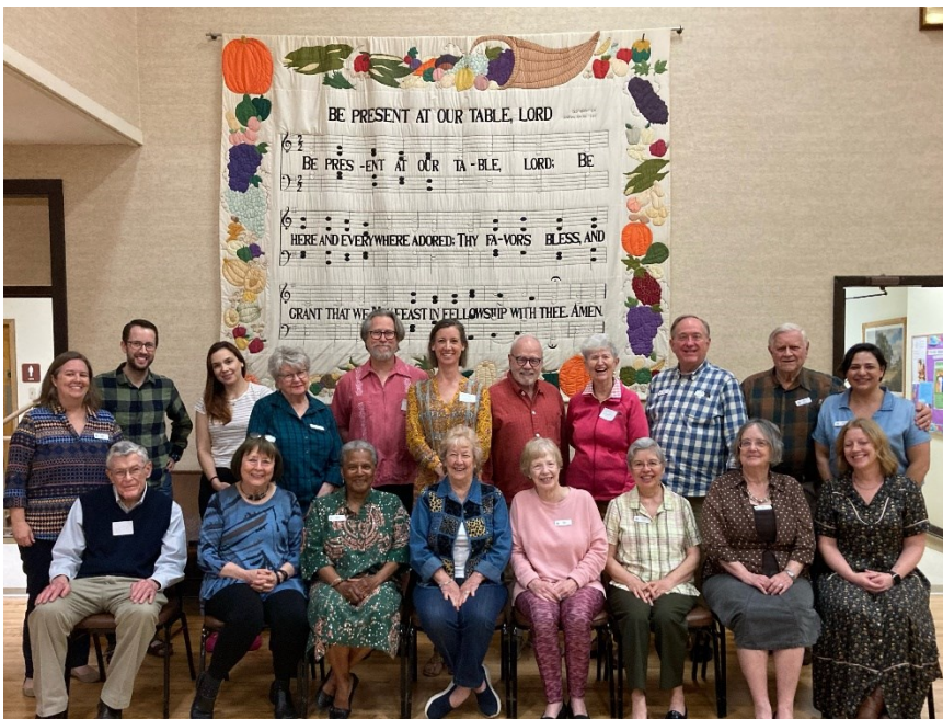
Photo: Participants in the February 25th closing Divine Dinner for In God's

In September of 2023, a small team began meeting together to plan a program to offer the Laurel Heights congregation the opportunity to engage in conversation about racism. We named the program In God's Steps and met for four months to lay the framework for this experience.